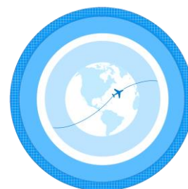
GLOBAL SOCIETY BADGE