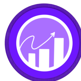
RAPID GROWTH BADGE