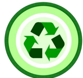
SUSTAINABLE SOCIETY BADGE