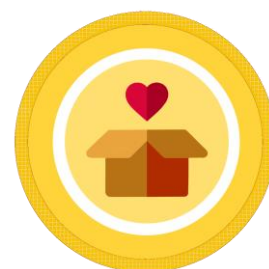
CHARITABLE SOCIETY BADGE