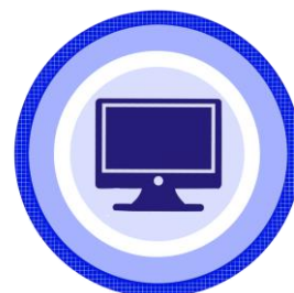
SOCIAL MEDIA BADGE